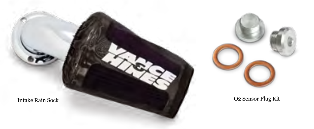
Intake Rain Sock